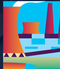
Utility & Power Generation